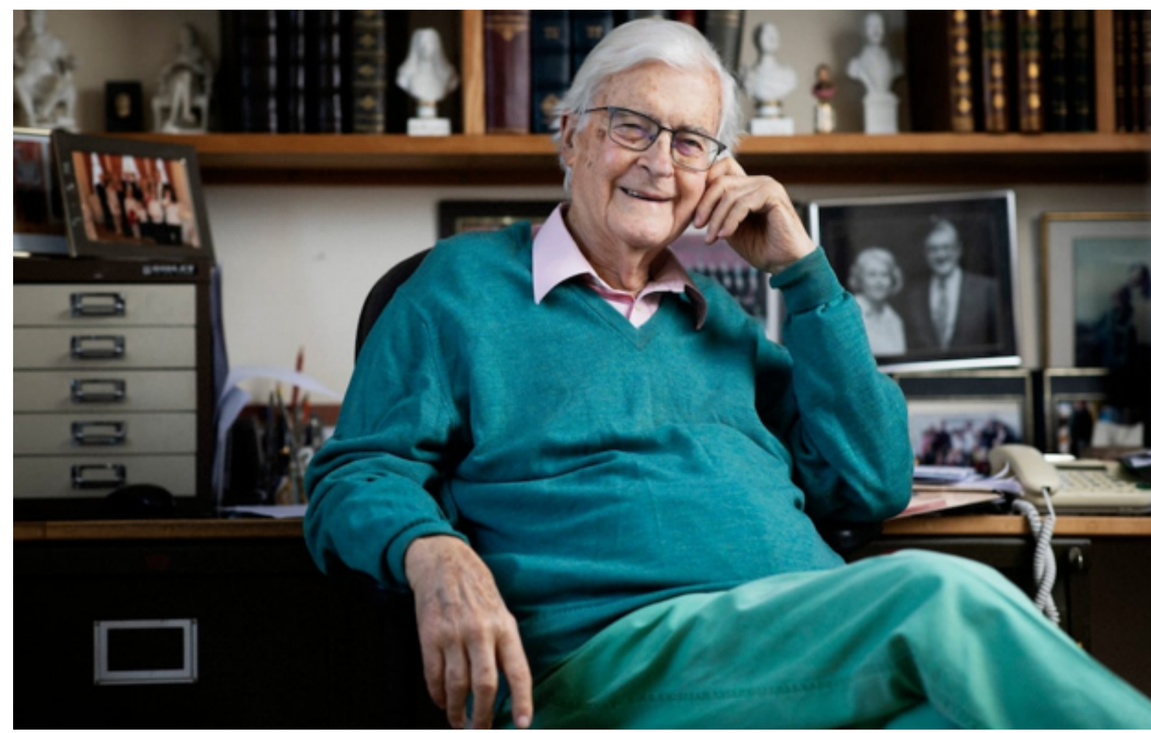
Lord Baker argues that the current schooling system fails to cater for cross-subject topics like green issues

Lord Kenneth Baker was six in 1940, when he was evacuated from west London to Southport, a seaside town in the North West, to escape Luftwaffe bombs. He remembers beaches and “genteel” shopping arcades – but his clearest memory stems from his schooling.