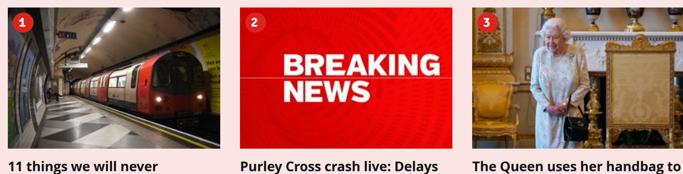
Purley Cross crash live: Delays as collision causes road closure