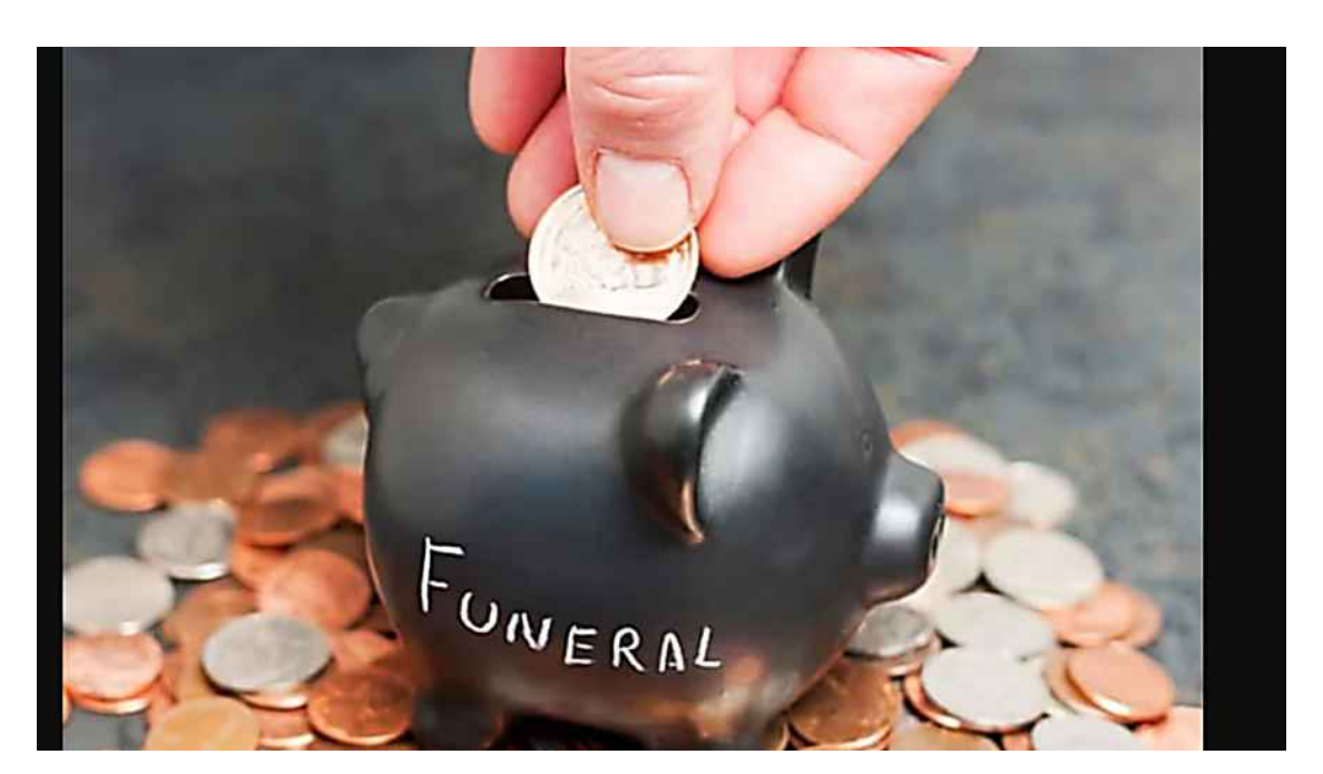
This Is How Much Funeral Insurance Should Actually Cost! EXPERTS IN MONEY | SPONSORED