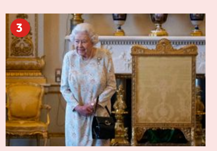
The Queen uses her handbag to send secret signals to her staff