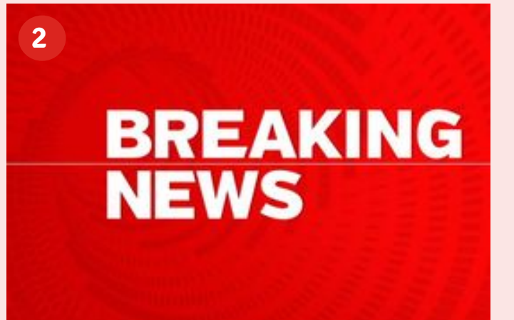
Purley Cross crash live: Delays as collision causes road closure