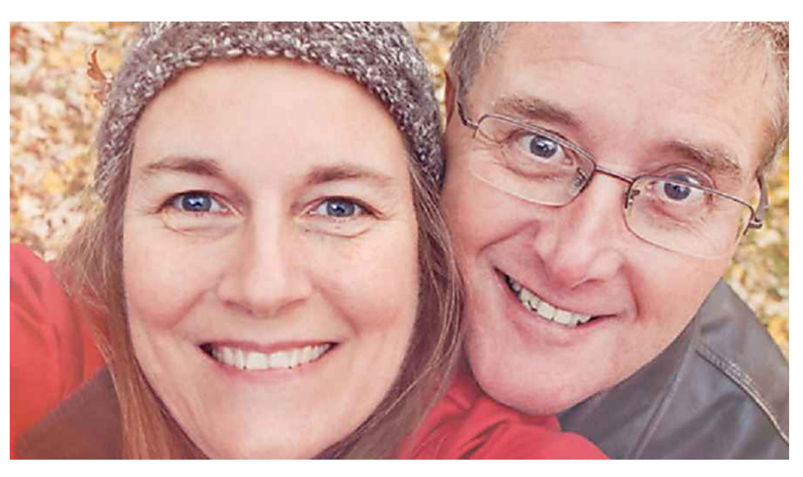
Incredible Record Breaking Remortgage Rates HOME MONEY EXPERT | SPONSORED

How Far Does £1,000,000 Go in Retirement?