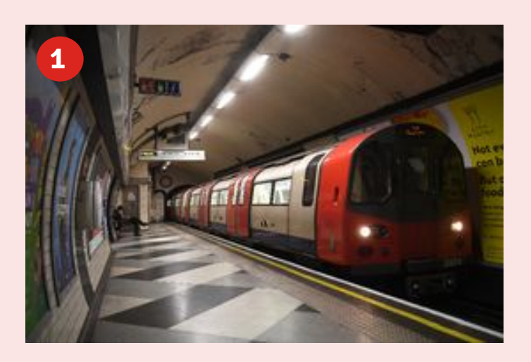
11 things we will never understand about the London Underground